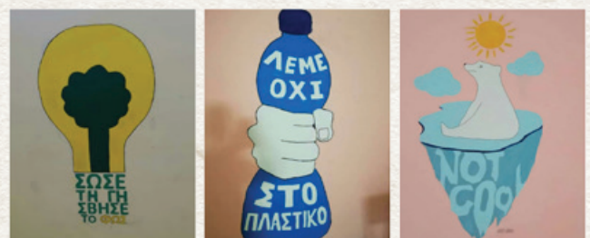
Mural art by students of 4 th Gymnasium A.Liosion