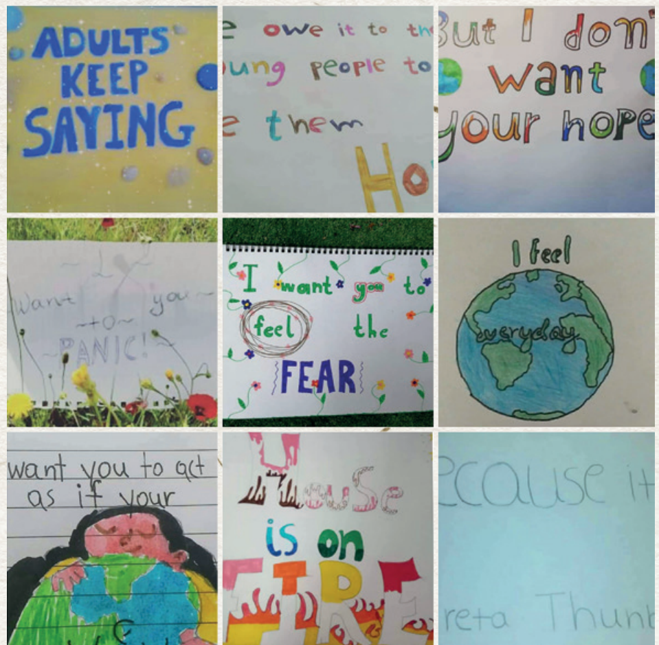
Art Work by students of 4 th Gymnasium A.Liosion for Earth Day

Walk the Global Walk Youth Leaders from the following schools: